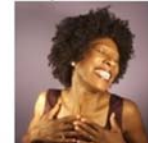
Me in Balancing Act . Mama exclaimed, "A show about your mental illness?"