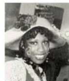
Me in Godspell - my first Broadway show - and the show I was performing at Ford's Theater in DC when . . .

Today, her passion is "Reminding YOU of YOUR Magnificence."