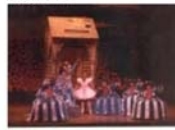
I am Addaperle, the Good Witch of the North in The Wiz . One of my many Broadway show tours.